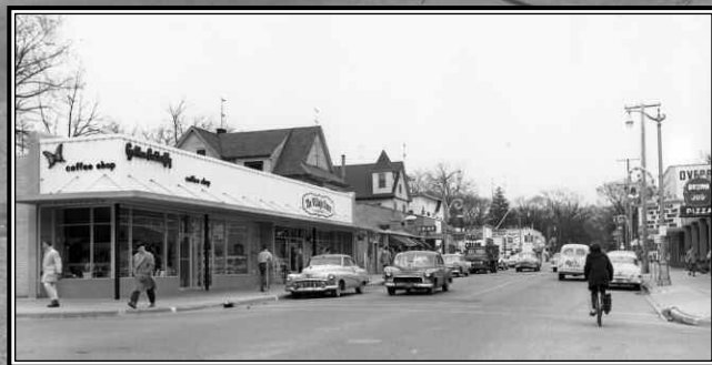
SOUTH UNIVERSITY LOOKING NORTHEAST FROM CHURCH STREET, 1960