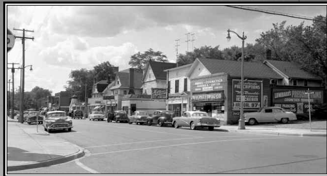
SOUTH UNIVERSITY LOOKING NORTHWEST FROM FOREST AVENUE, 1954