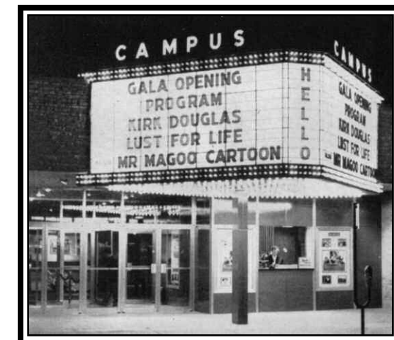
STUDENTS AND TOWNSFOLK IN THE EARLY 1960S SHARED THE FUN OF APPLAUDING OR HISSING DURING MOVIES.

The Brown Jug (circled above left) opened in 1935 on the other side of the street. A favorite restaurant with students and alumni, its name celebrated the trophy for UM's historic football rivalry with the University of Minnesota. The Campus Theater opened in 1957 down the block from the Brown Jug. It catered to a growing art film audience, which lined up to see the latest Fellini or Bergman release.