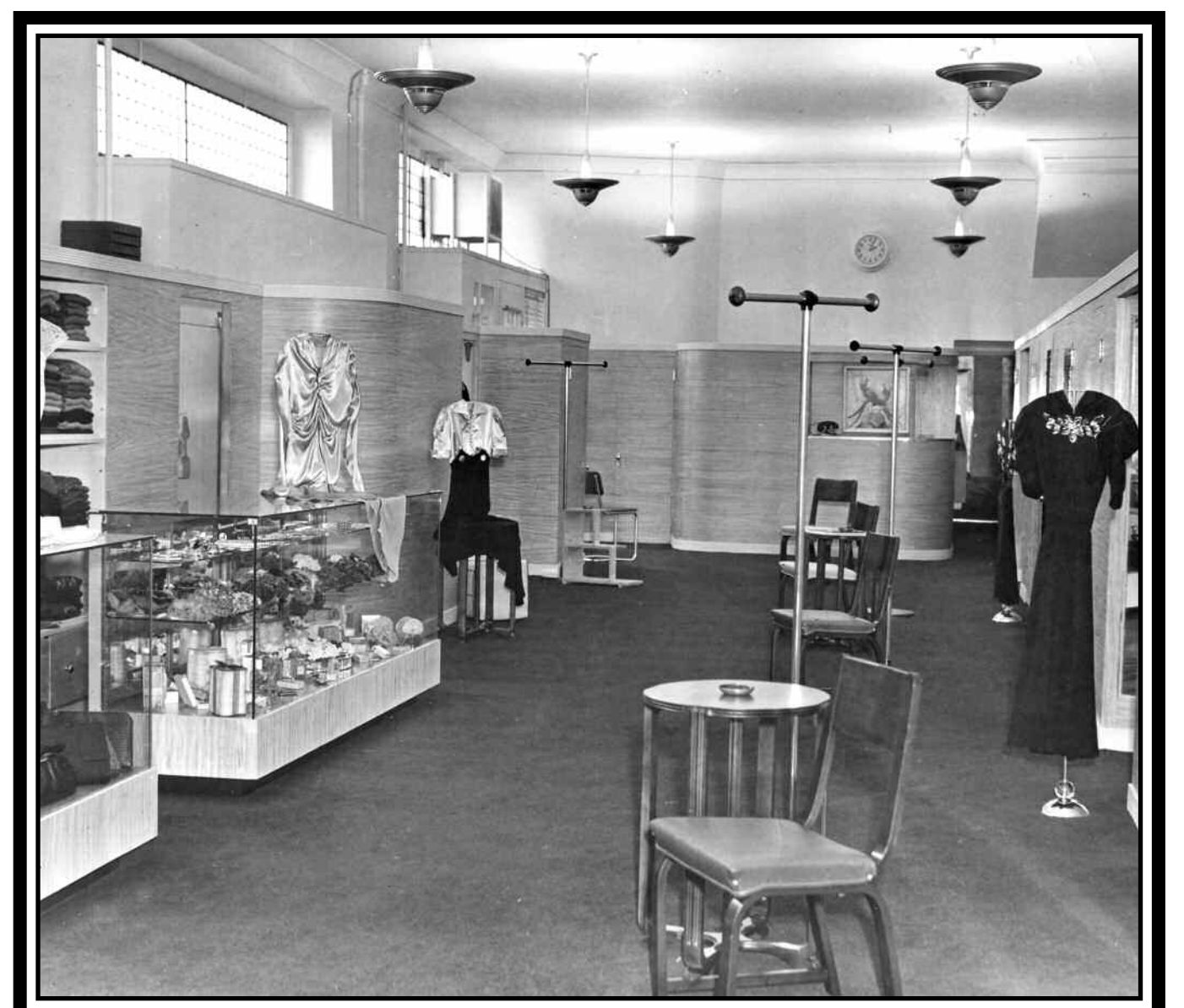
FROM 1916 TO 1990 THE HUTZEL SHOP, SHOWN AT RIGHT IN THE 1930S, SOLD ELEGANT LADIES' WEAR. CUSTOMERS SAT IN COMFORTABLE CHAIRS WHILE OUTFITS WERE BROUGHT OUT FOR SELECTION.