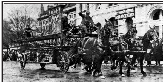
A FIRE DEPARTMENT HOOK-AND-LADDER PASSES THE COURTHOUSE AND THE HAMILTON BLOCK IN A PARADE ON EAST HURON ST. ABOUT 1910. CONSTRUCTED IN THE SAME YEAR AS THE HAMILTON BLOCK, THE FIREHOUSE NOW IS HOME TO THE ANN ARBOR HANDS-ON MUSEUM.