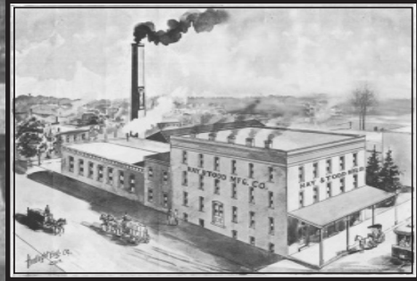
HAY & TODD MANUFACTURING COMPANY, 1896