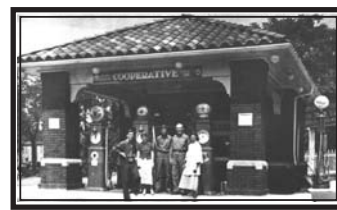
BAUMGARDNER'S BUILDINGS WERE REPLACED IN THE 1930S BY A GAS STATION LATER RUN BY THE ANN ARBOR COOPERATIVE SOCIETY. THE BUILDING WAS CONVERTED TO A RESTAURANT IN 1977.