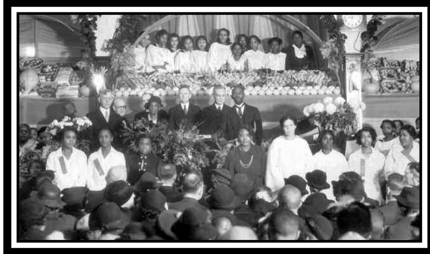
SECOND BAPTIST CHURCH (LEFT) CELEBRATED HARVEST DAY IN THE 1940S IN THEIR ORIGINAL 1880S BUILDING ON THE SOUTHWEST CORNER OF BEAKES STREET AND NORTH FIFTH AVENUE. THE CONGREGATION BUILT A NEW CHURCH ON THE SITE IN 1953.