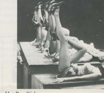
Presenting the Hot Box Girls