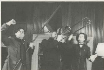
Major Barbara, 1994