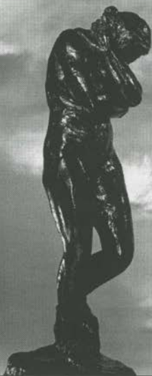
Eve by Auguste Rodin

T he new Frederik Meijer Gardens Sculpture Park in Grand Rapids offers 25 major sculptures by giants like Rodin and Aristide Maillol and Henry Moore, gathered where they truly belong: out among the forces of the wind and growth and the shifting light.