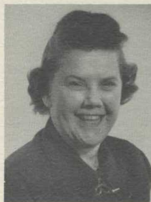
Gertrude North Machine Shop 10 years