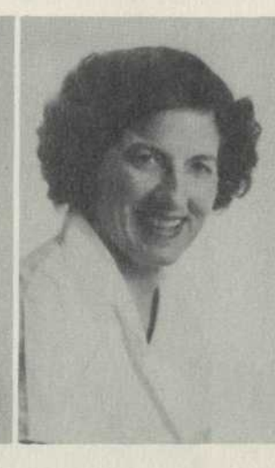
Catherine Stotts Optical Assembly 10 Years