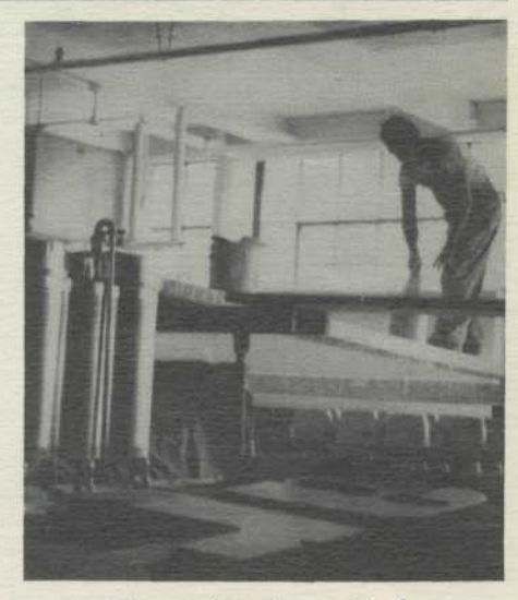
The ceiling is painted.

On August 4 the cafeteria reopened completely redecorated.