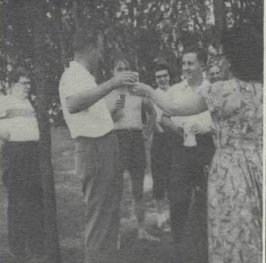
"Here's to you!"