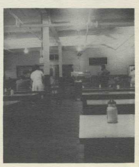
Completely remodeled and ready for business.