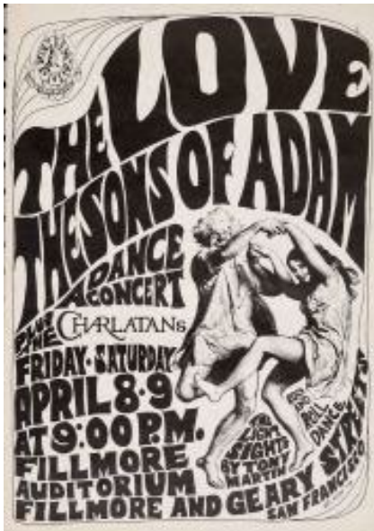
'The Love' Family Dog Handbill

"What the hell is this?," he thought. "It's neat!," and he stuffed it into a book. He soon found himself going to one of the early dances.