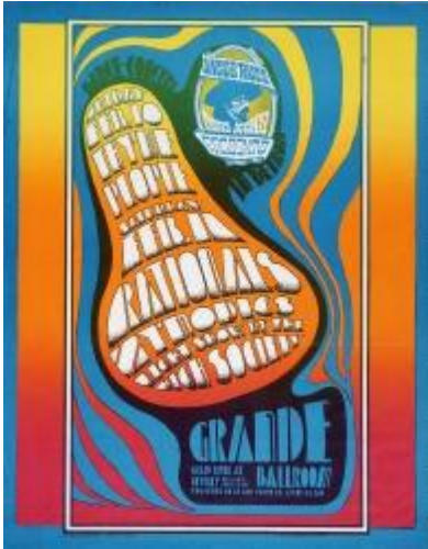
Gorgeous Rational's Poster

The Grande series, in the beginning, had quite a few posters (and many handbills), but over time, the accent on posters was replaced by a greater use of the postcards, as Detroit did not have that many places at the time to display posters. So the posters gave way to the cards and many of these cards are still available to collectors today. The posters on the other hand are already somewhat rare and some of the handbills are so rare that there may be but one known copy.