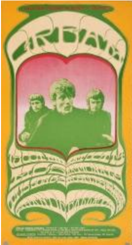
A Rare Cream Poster

Today, many of the major Grande Ballroom posters are rare high-ticket items like any of the Family Dog or Bill Graham Presents originals, costing several thousand dollars apiece. And they can be very difficult to find. A complete set of Grande Posters has never appeared on the market, to my knowledge, but there have been a few near-complete sets that have surfaced.