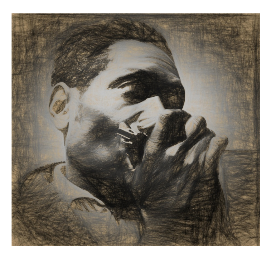
Big Walter Horton, my favorite harp player