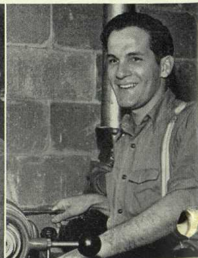
RALPH ROSENBERG Machine Shop