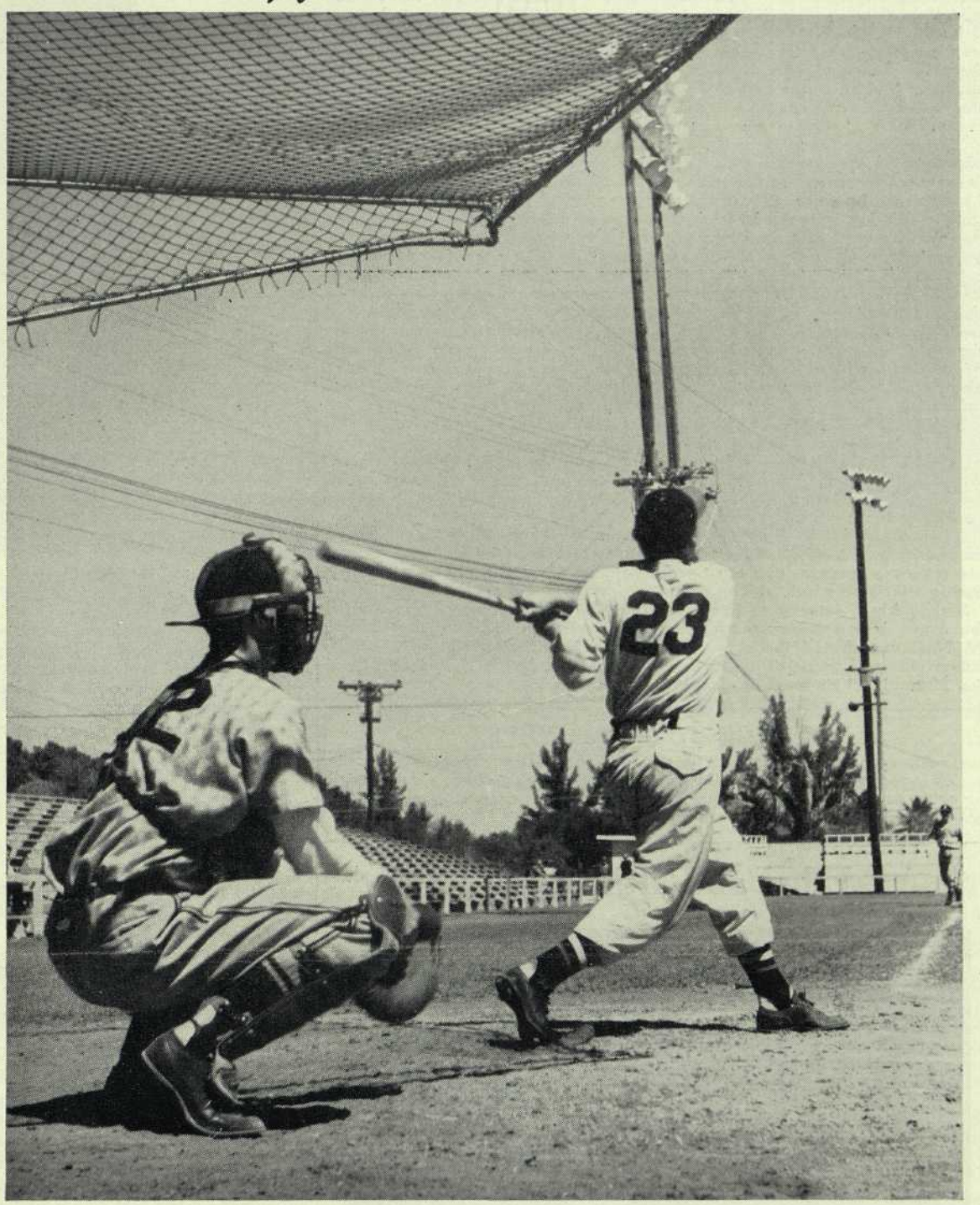
It's baseball time again, so don't forget to take your camera along the next time you go rooting for the Home Team. Above is a fine example of the top-notch baseball pictures you can get with your Argus camera.